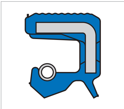
Simmerring BAUMSL ...